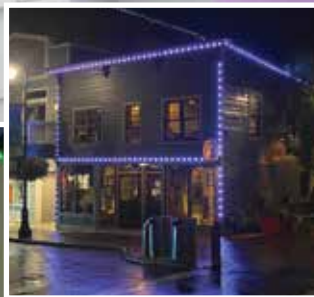
SIDE MOUNT, TOO!