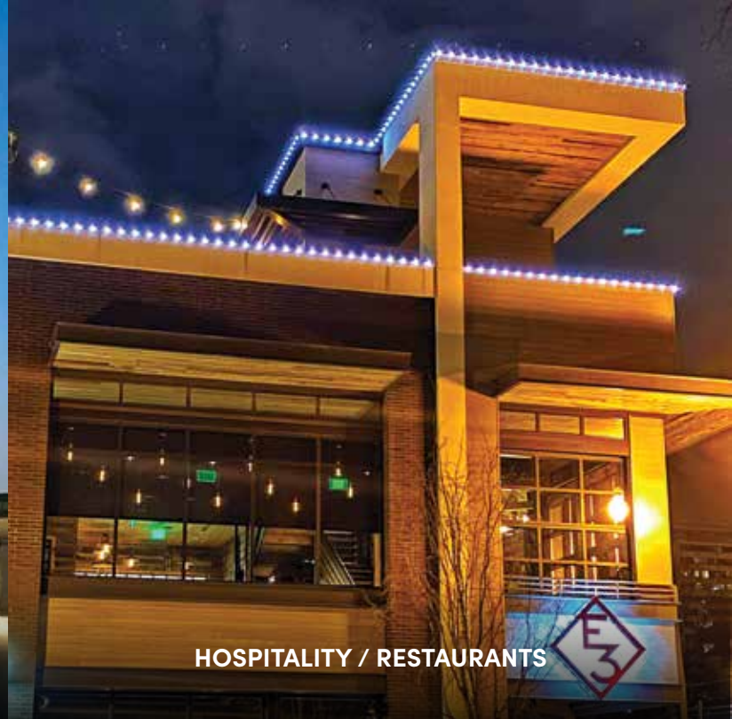
HOSPITALITY / RESTAURANTS